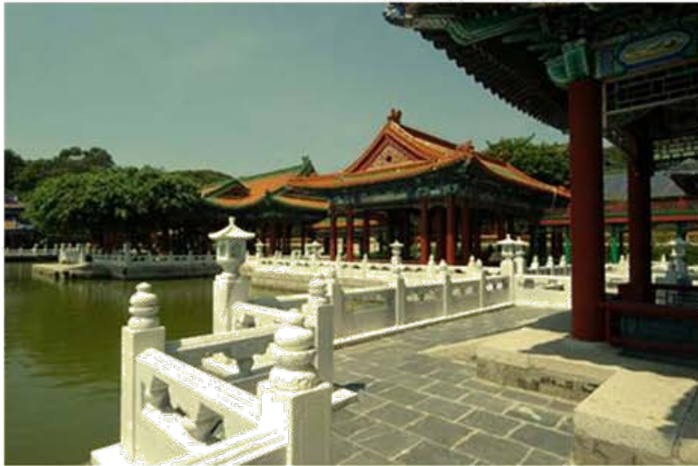
•New Yuan Ming Palace, modeled after Yuan Ming Yuan in Beijing