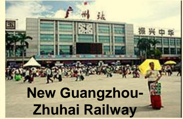
New Guangzhou-Zhuhai Railway