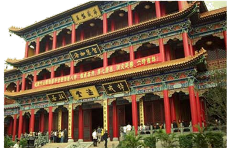
•Jintai Buddhist Temple, built at the end of the Song Dynasty is over 1,000 years old