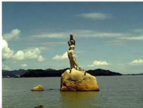
•Fisher Girl Statue