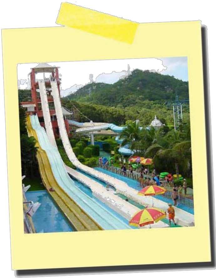
Pearl Land (Amusement Park)