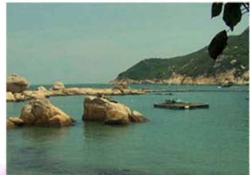
•Over 100 Islands for Wildlife, Diving, and Seafoods