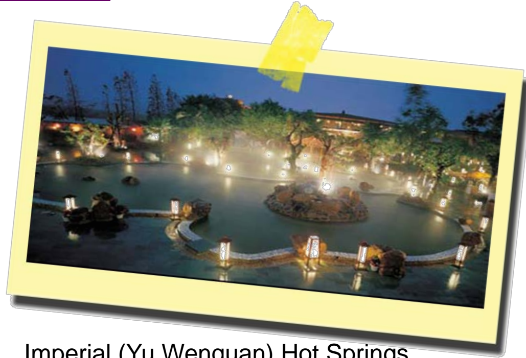
Imperial (Yu Wenquan) Hot Springs Resort in Doumen, the first Japanese outdoor garden-style hot springs resort in China, with over 20 kinds of hot springs.